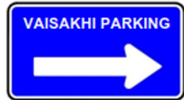
24" x 36"