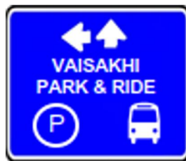
36" x 36"