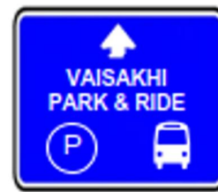
36" x 36"