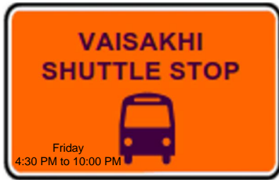
Double sided 24" x 36"

The custom signage used in the parking plans for Friday and Saturday are shown below with their dimensions: