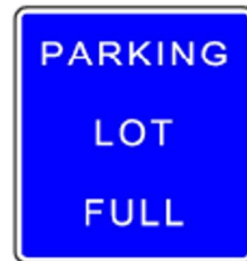
36" x 36"