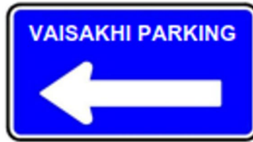
24" x 36"